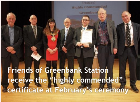
Friends of Greenbank Station receive the "highly commended" certificate at February's ceremony

"I grew up on Castle and spent many an hour at Greenbank station, during the 1960s (when it was still known as Hartford And Greenbank), spotting trains. In those days it was staffed, and I would help the porter