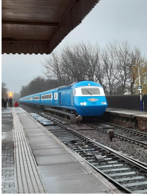
The pictures show the Blue Pullman passing Platform 1 as it heads in the direction of Woodley and Guide Bridge.