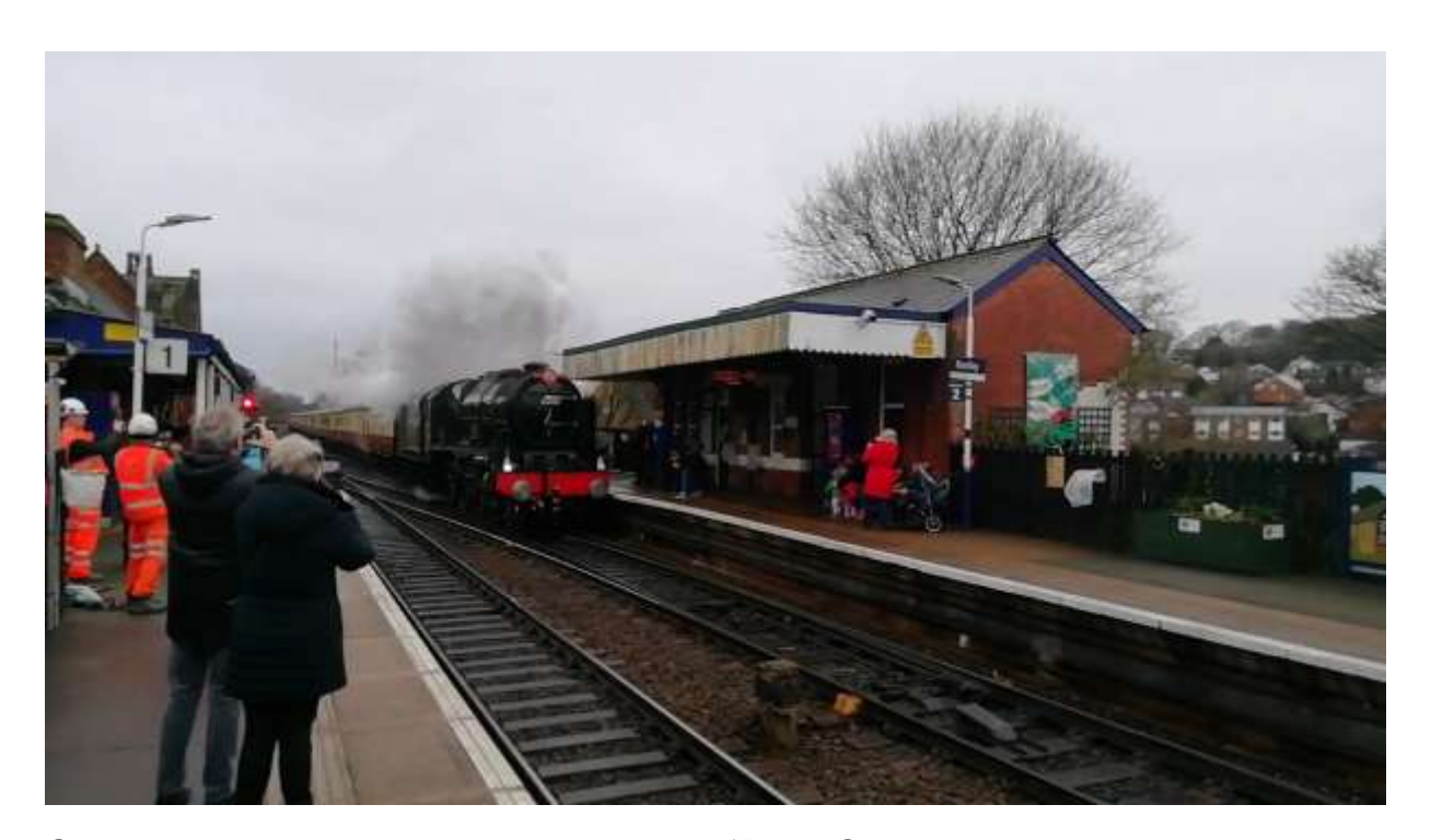
On Wednesday 2nd February 2022, 46100 'Royal Scot', paid us another visit whilst on its way from Wolverhampton to York.